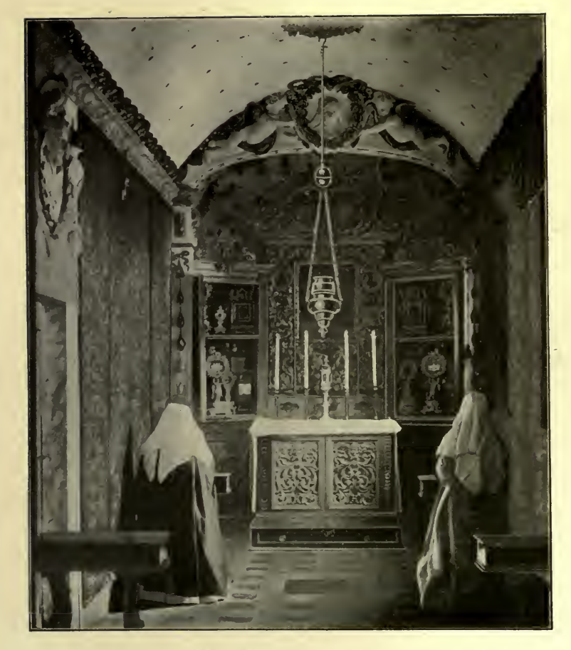
THE ORATORY AT SAN VINCENZIO-ONCE THE SAINT'S CELL.