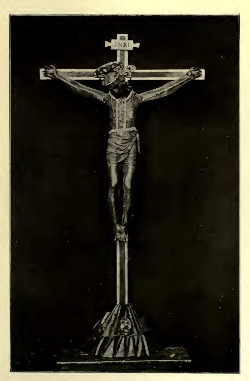
THE SAINT'S MIRACULOUS CRUCIFIX.