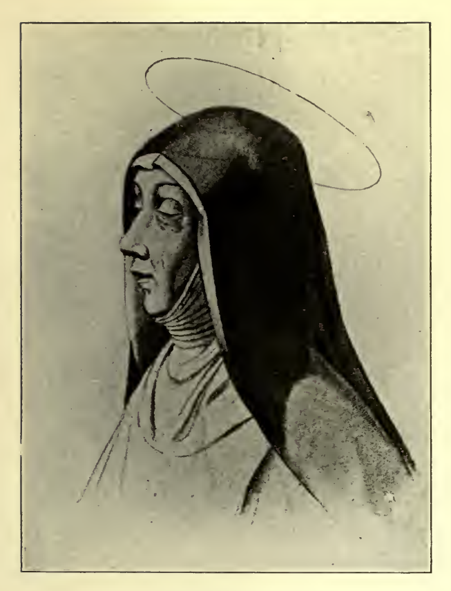
ST. CATHERINE DE RICCI, From a death-mask preserved by the nuns of Prato.