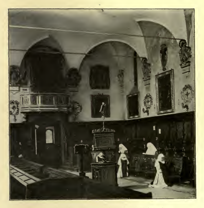
THE NUNS' CHOIR AT SAN VINCENZIO.